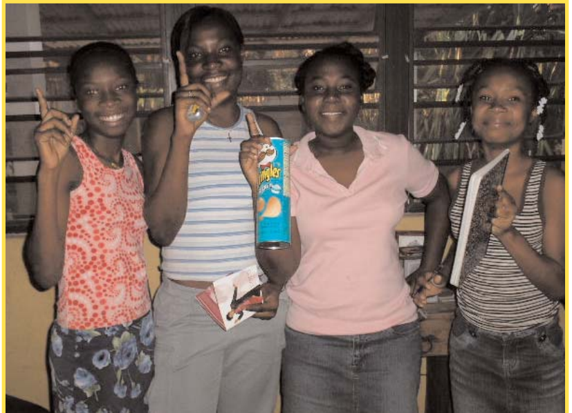
Four teens from Port au Prince Fellowship who gather at our house twice a week to practice songs to sing in church.