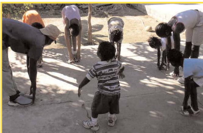
Morning Exercises at the Toddler House

take their first steps and say their first words. All of the moments that a parent should have.