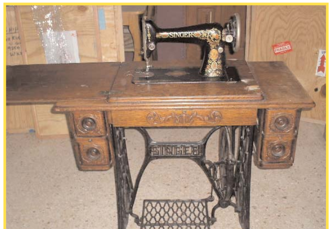
One of three treadle sewing machine collected so far for the Women's Program

We have expanded of our ministry to include the women of Haiti. Our goal is to give women the tools necessary to independently provide for their own families. Tools against poverty in the form of education, is a wonderful gift to be able to give them faith-based vocational training in such areas as; Nanny Training, Sewing, Fish Harvesting and Bread Baking. We also provide various life skills focused on women's development. This vocational training give's these women an opportunity to go back out into their community with a skill set that will provide them with financial independence.